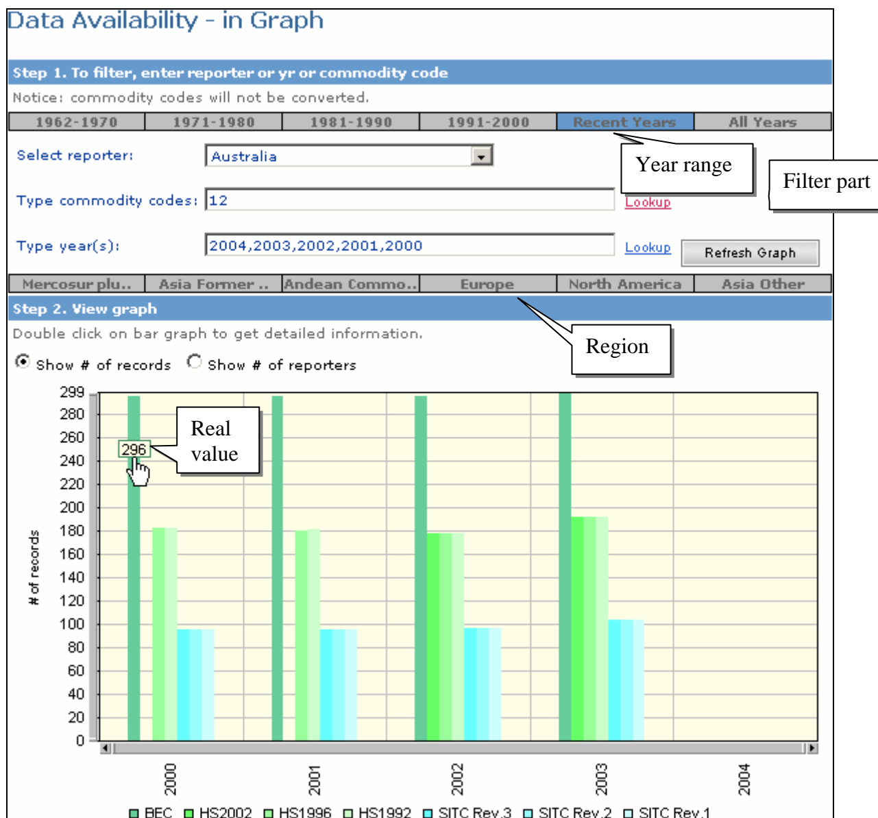
Figure 4: 'In Graph' results

The 'In Graph' interface is reproduced below, with a selection already carried out: